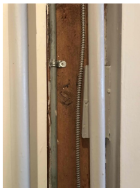
Woodwork, Doors, Trim